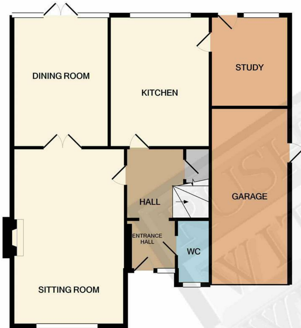
GROUND FLOOR APPROX. FLOOR AREA 828 SQ.FT. (76.9 SQ.M.)